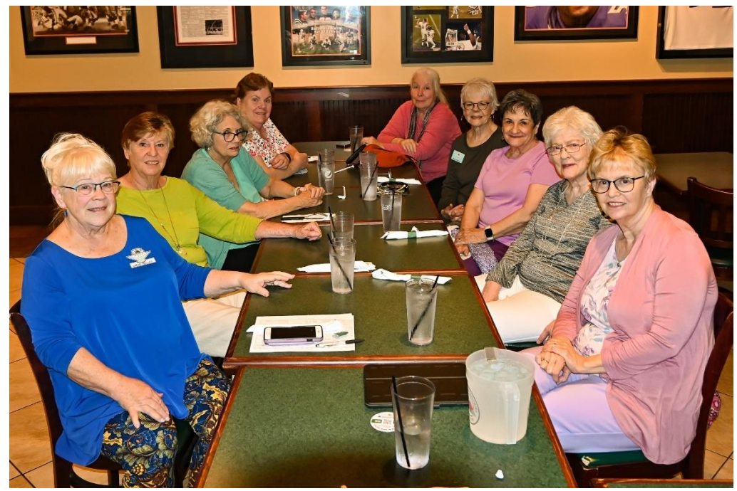
And The Girls