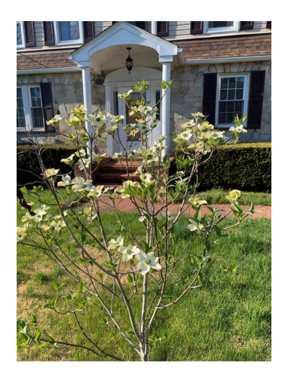
And here it is today, a year later. A great memorial.