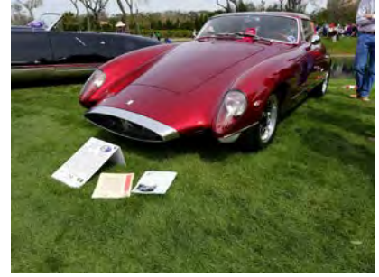
Figure 4 '66 Bosley