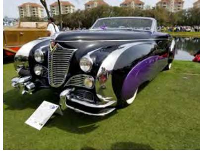
Figure 3 '48 Saoutchik Cadillac Model 62