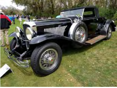
Figure 2 '29 Deussen

impending rain forecast. Among the showcase of cars were many classics. Here are just a few that I thought were particularly impressive.