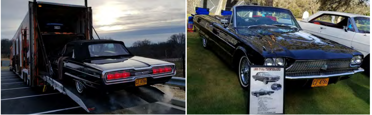
Figure 1 Leaving MD