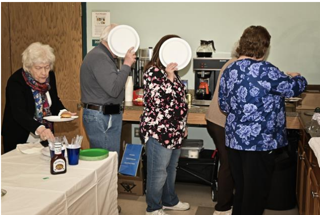
Our stealth members....