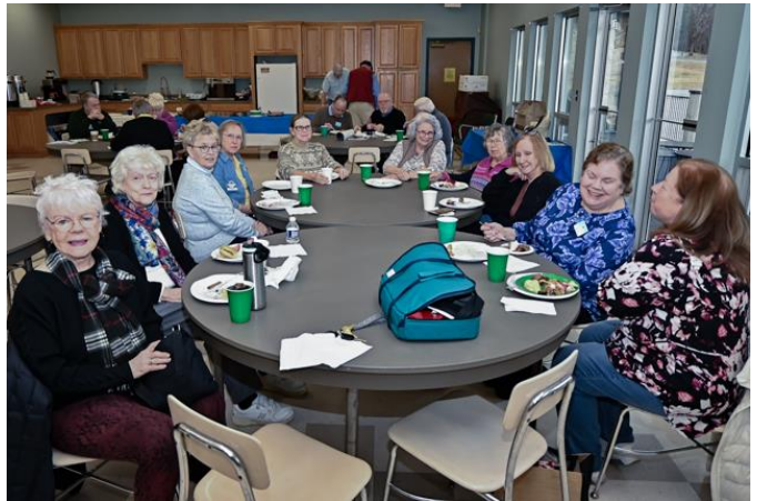
Wonder what is being discussed here....